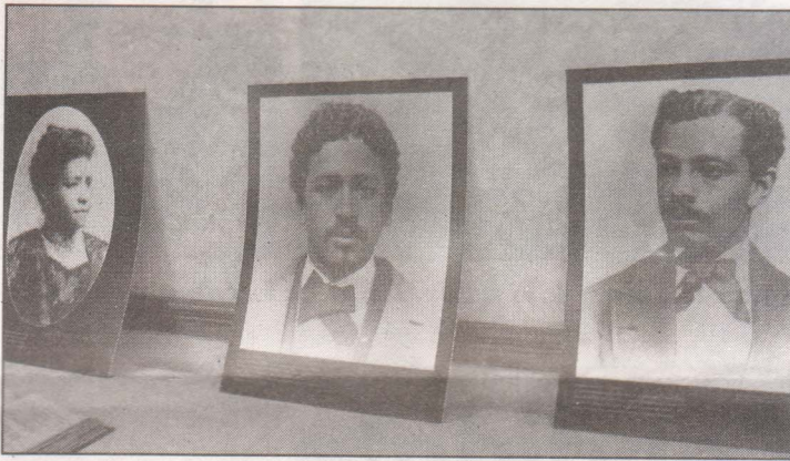
Part of the traveling exhibition, "12 Black Classicists."